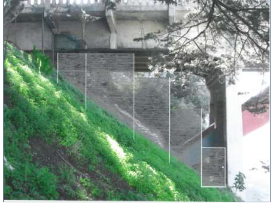
Here's a close-up look