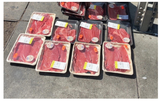
VIOLATION: Selling food or drinks not allowed by the program