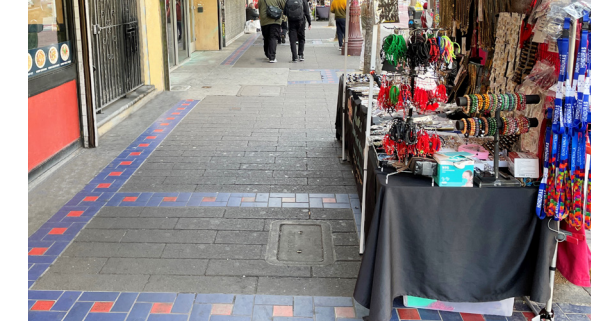
COMPLIANT: 6-foot, straight, unobstructed path of travel maintained