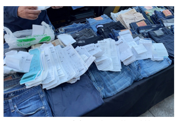
COMPLIANT: Proof of ownership readily available